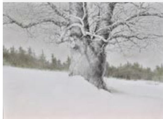
'Witches Hand' by Doug Gillette

Everyone is invited to attend, but please only members bring their 1 or 2 works to be critiqued