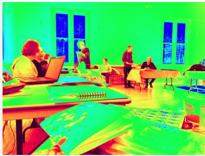
Creative fun at Tues. Painters

In this newsletter there are many art events and opportunities coming along - so read on, partake and enjoy!!